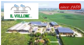
Soc. Agr. IL VALLONE s.s. Registration no. IT 01219570411 Filo di Argenta - Ferrara