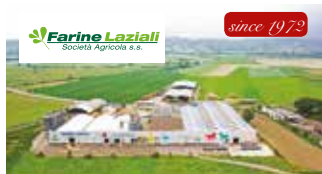
Soc. Agr. FARINE LAZIALI s.s. Ponzano Romano - Roma